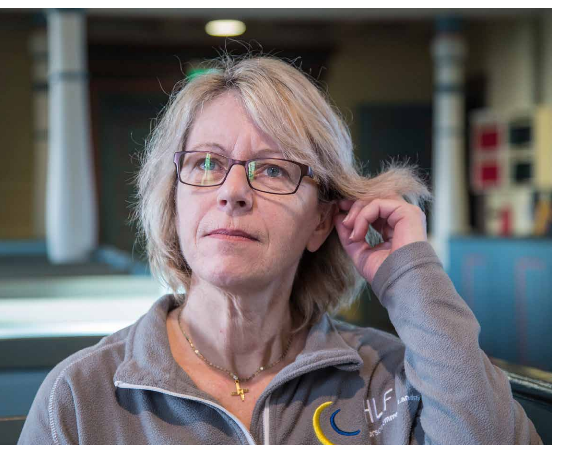
TELECOM LOOP: With a telecom loop, the hearing impaired can hear the sermony in Time Church.