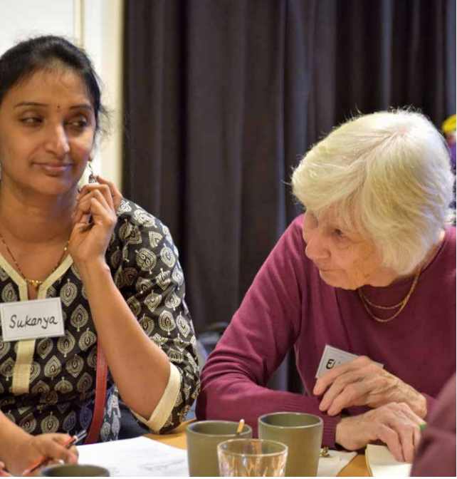
MEETING PLACE: The Citizen Square gathers the local community in Borgen.