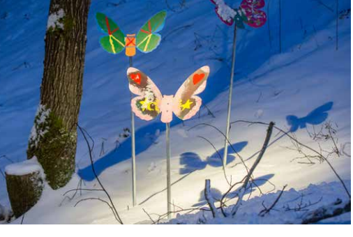
DECORATION: Light decoration designed by Olsson & Linder and Saupstad/Kolstad Youth Council, contributes to the sense of security in the Firblad Forest.